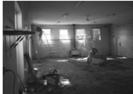
A view of the Seminary's Refectory during the two week holiday with the repairs of the walls under way.