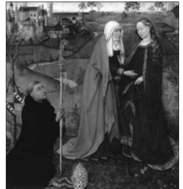
Jacques Daret's Visitation

The reinforcements are, of course, the grace of God, brought to us by Our King and Saviour, Who Himself has already conquered the enemy. We need merely to follow Him and cooperate in His victory. An example of the ideal of the Christian combatant can be