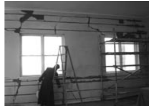
The east wall of the Refectory with cracks and cuts repaired.