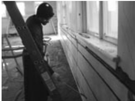
Brother Francis mortars the reinforcing cables inserted in the cuts in the walls.