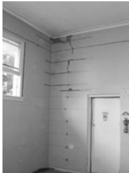
The Northeast corner "held together."