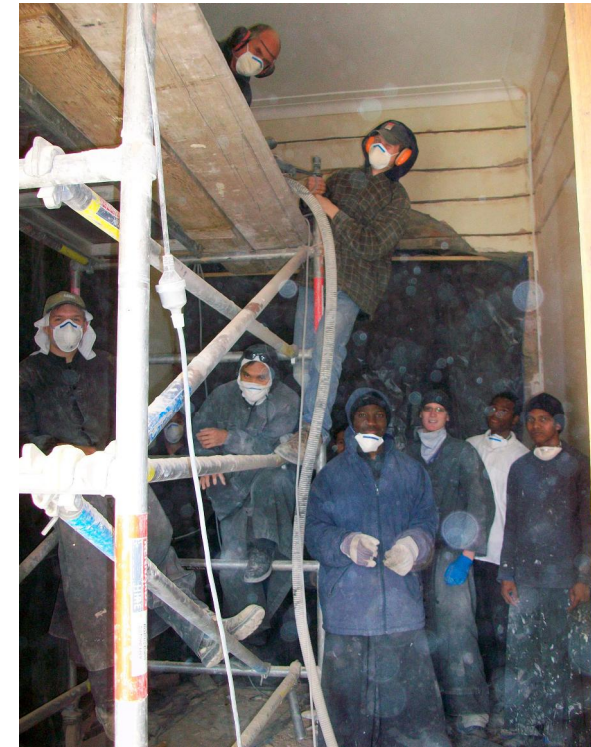
Brothers and Seminarians pose in their dusty work

Additionally, in order to secure a lasting and sufficient water source for the operation of the Seminary property, a bore was drilled and an application lodged before new legislation would forbid the acquisition of new ground water licences. A substantial source was tapped and we now await the NSW Office of Water to grant the acquisition rights. Please pray for this intention.