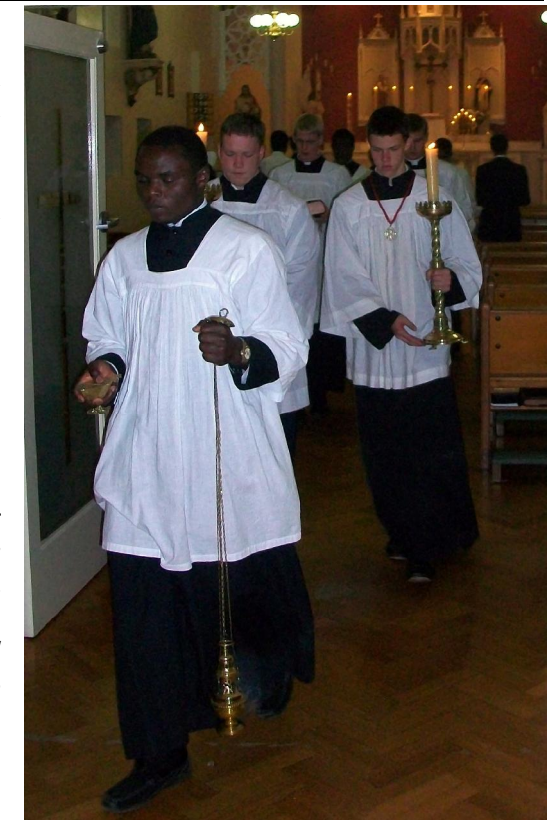
Recession after Sunday Vespers

Although many are familiar with St. Louis de Montfort's doctrine on Our on Our Lady's exceptional role in the salvation of souls, the Total Consecration to Mary , few genuinely live this devotion, says the Saint. This secret reveals a simpler and more certain path to holiness by an act of complete giving of self to Our Lady so as to more easily be drawn near to God and His perfection. There is no magical formula to bring about the transformation of a sinner to a saint, but the simpler way is by the wilful, humble and confident slavery to Our Lady.