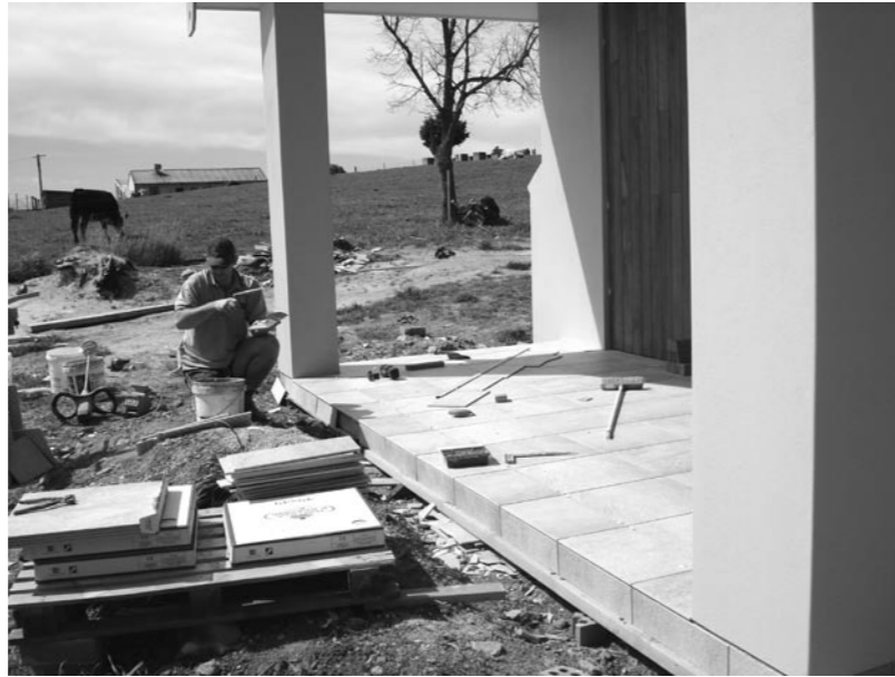
Work continues on the Cemetery Chapel with the installation of the tile floor

We need your help to purchase linen for new Altar and Mass linens. We are also in need of replacing many worn sets of sacred vestments for the Holy Sacrifice of the Mass. Thank you for your generous help.