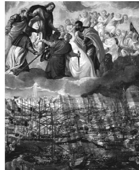
The Battle of Lepanto with the saints interceding before the Blessed Virgin Mary for the Christian fleet as it faces overwhelming odds against the Ottoman Fleet. By Paolo Veronese, c. 1572

With what great joy we ought to celebrate the anniversary of the Victories of the Blessed Virgin Mary! The victories of the Immaculata give great honour to God and shower abundant blessings upon mankind, for her victories either draw men nearer to or help them return to the King of kings, Our Lord and Saviour! This is the victory of our Lady over the devil and the enemies of God.