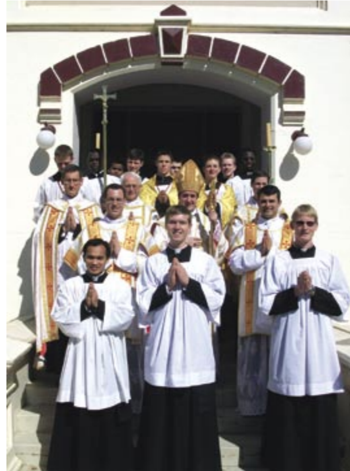
Group photograph after the ceremonies