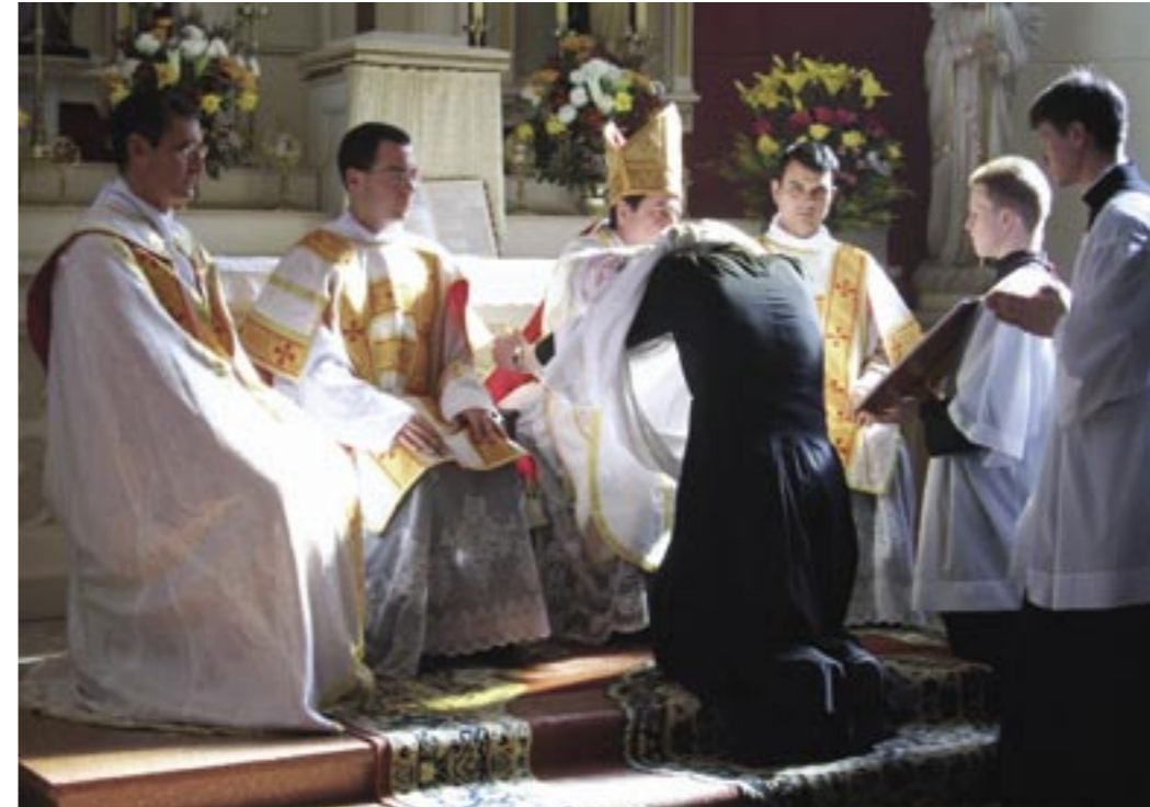
The investiture of the Surplice – the "Putting on the New Man"

This is not romantic prose describing a starry-eyed notion of Christ's Priesthood, as many worldlings may fancy in their attempt to dispense themselves from the burden of facing Christian generosity. Our lives, if truly Catholic, will be resplendent in joy. All men are called to this ideal, regardless of their state in life - how much more repugnant it is to witness a cleric or religious, embittered and unhappy in his consecrated life. Such sadness or fears are the fruit of a lack of generosity to God and to neighbour.