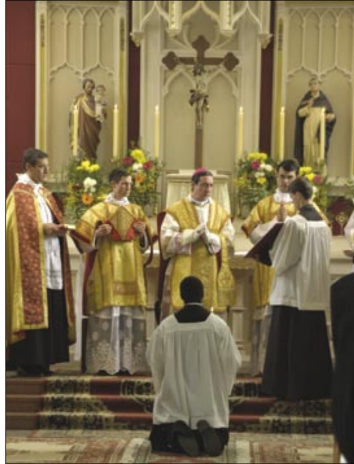
The response of the generous man to God's Call: Here am I, Lord!

Devotion is an act of the will, moved to a good identified by the intellect. Man has the duty to inform his intellect with the truth – primarily, the truth of God's supreme goodness. Recognizing that God is our greatest good, we readily surrender ourselves to God's Will. Our increased knowledge of God disposes us to an increased desire of giving ourselves to Him and employing fitting means to that union. God whispers to the soul meditating on eternal Truth that He alone can satisfy the desire of true happiness.