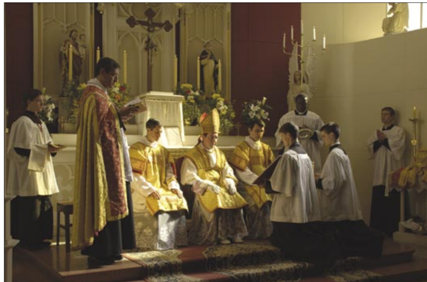
The Call to the seminarians to present themselves to the Bishop to receive the Minor Orders: Accédant omnes qui ordinandi sunt!