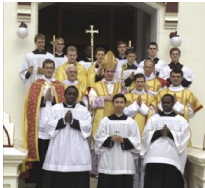
After the Ceremonies of the Minor Ordinations – a new Cleric, a new Porter-Lector and a new Exorcist-Acolyte. Lord, grant us many holy priests!